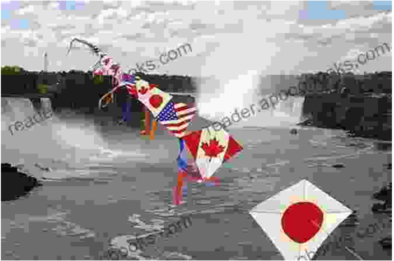
A man flies a large, red, white, and blue kite over the Niagara Falls Suspension Bridge.